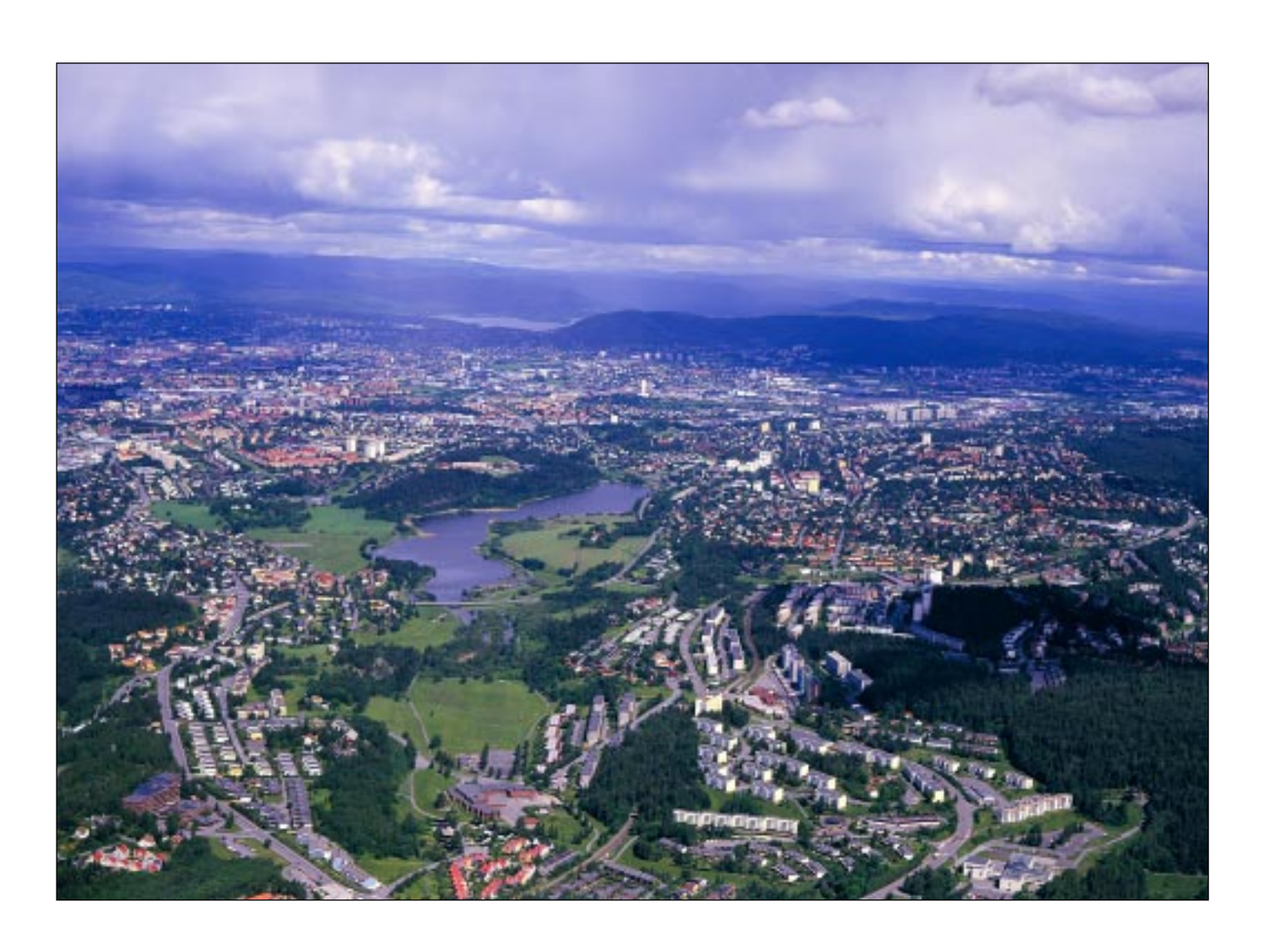
A PRESENTATION OF THE AREA